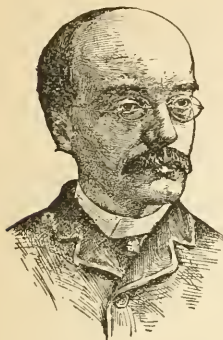
JOHN BACH MCMASTER.

H ISTORY OF THE PEOPLE OF THE UNITED STATES, from the Revolution to the Civil War. By JOHN BACH MCMASTER. To be completed in five volumes. Vols. I, II, and III now ready. 8vo, cloth, gilt top, $2.50 each.